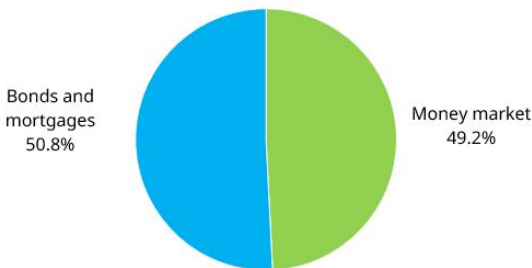
Diversified income fund portfolio at December 31, 2023

The chart below shows the DIF asset mix on December 31, 2023: