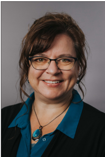
Donna Harpauer Minister Responsible Saskatchewan Pension Plan

The Honourable Donna Harpauer Minister Responsible Saskatchewan Pension Plan